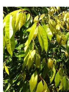
Waterhousia floribunda Weeping Lily Pilly