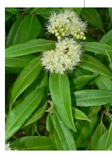
Backhousia citriflora Lemon Scented Myrtle