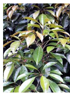
Eleocharpus eumundii Eumundi Quandong