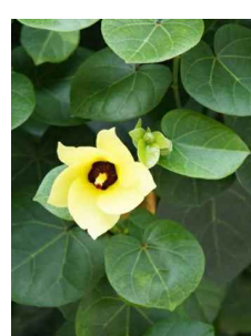
Hibiscus tiliaceus Cotton Tree