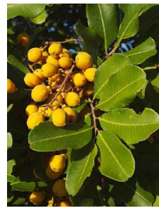
Cupaniopsis anacardioides Tuckeroo