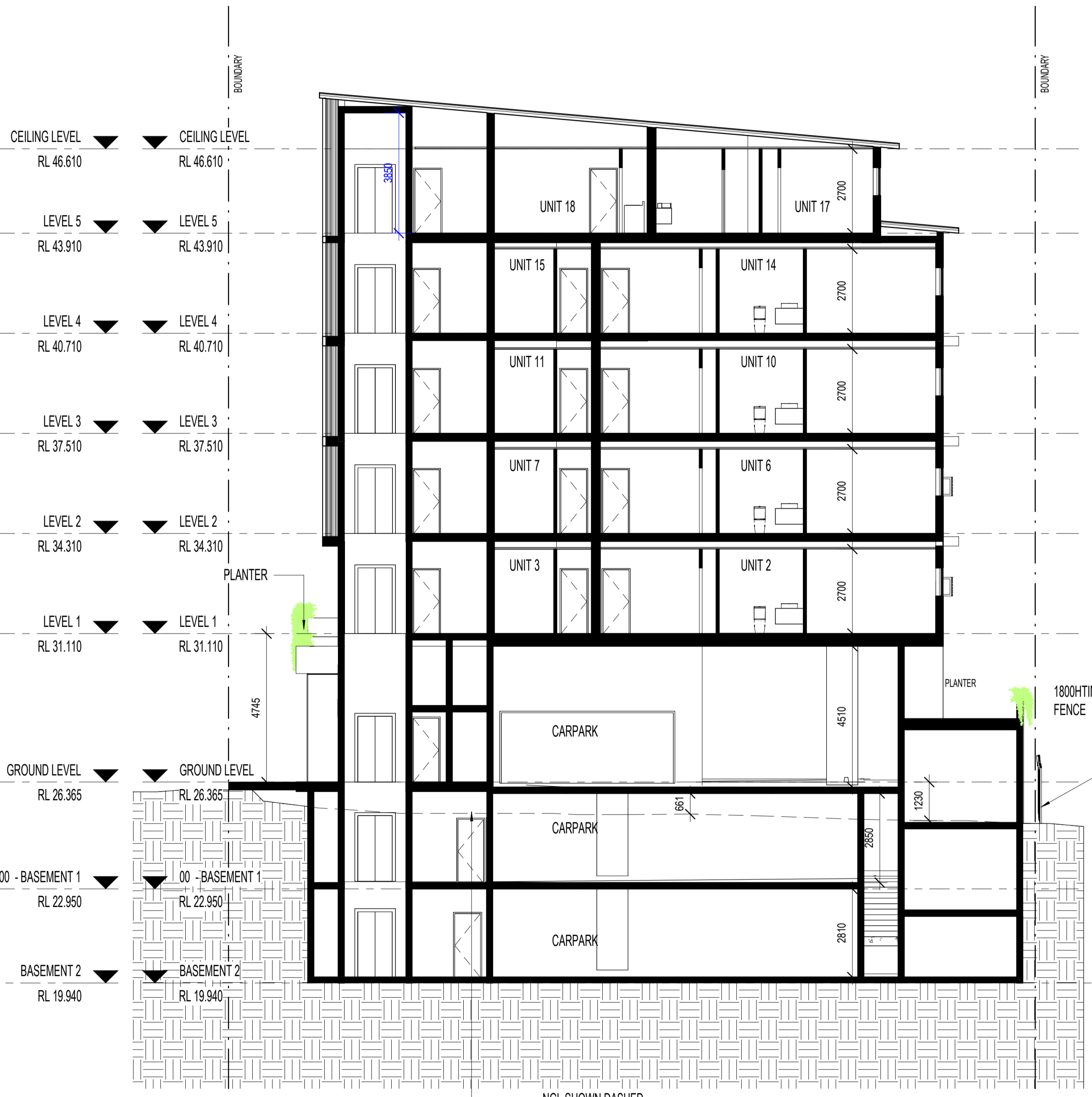
SECTION B-B 1:100