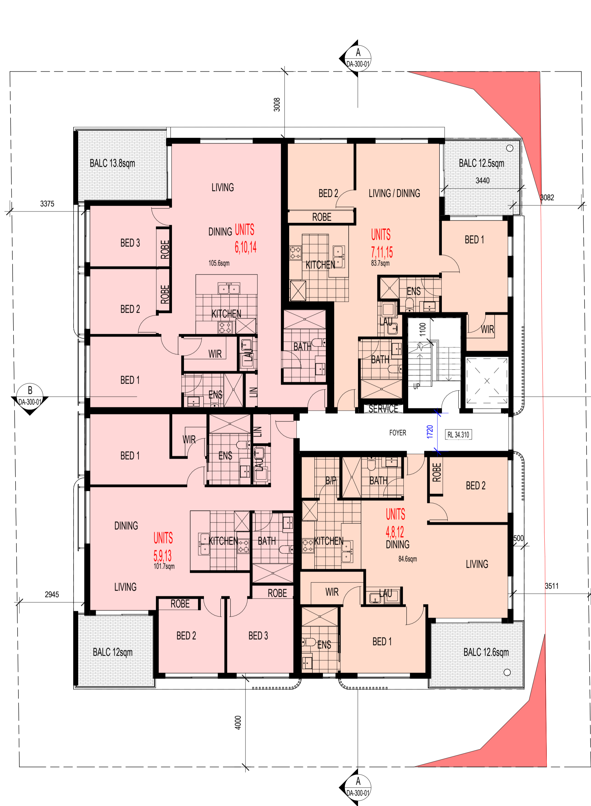
03 - TYPICAL LEVEL 2-4 1:100