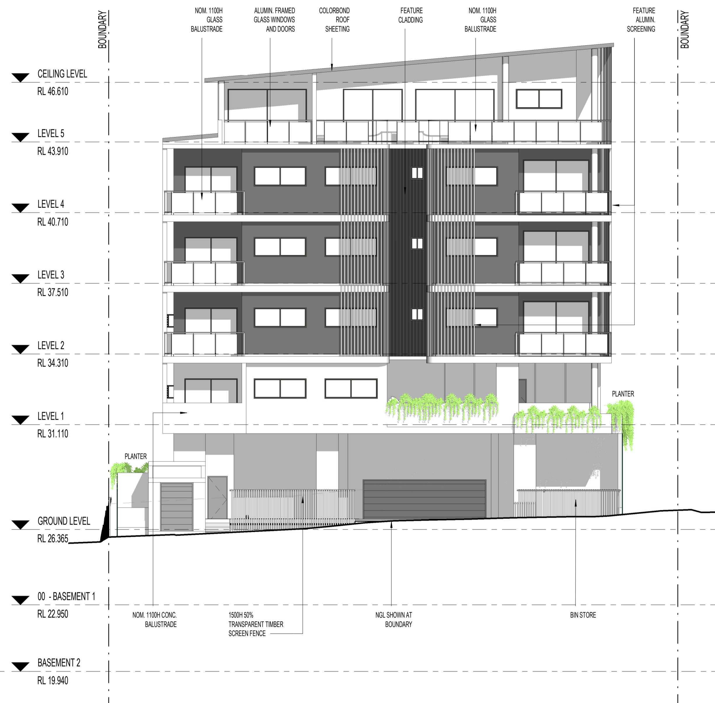
○ SOUTH - ELEVATION 1:100