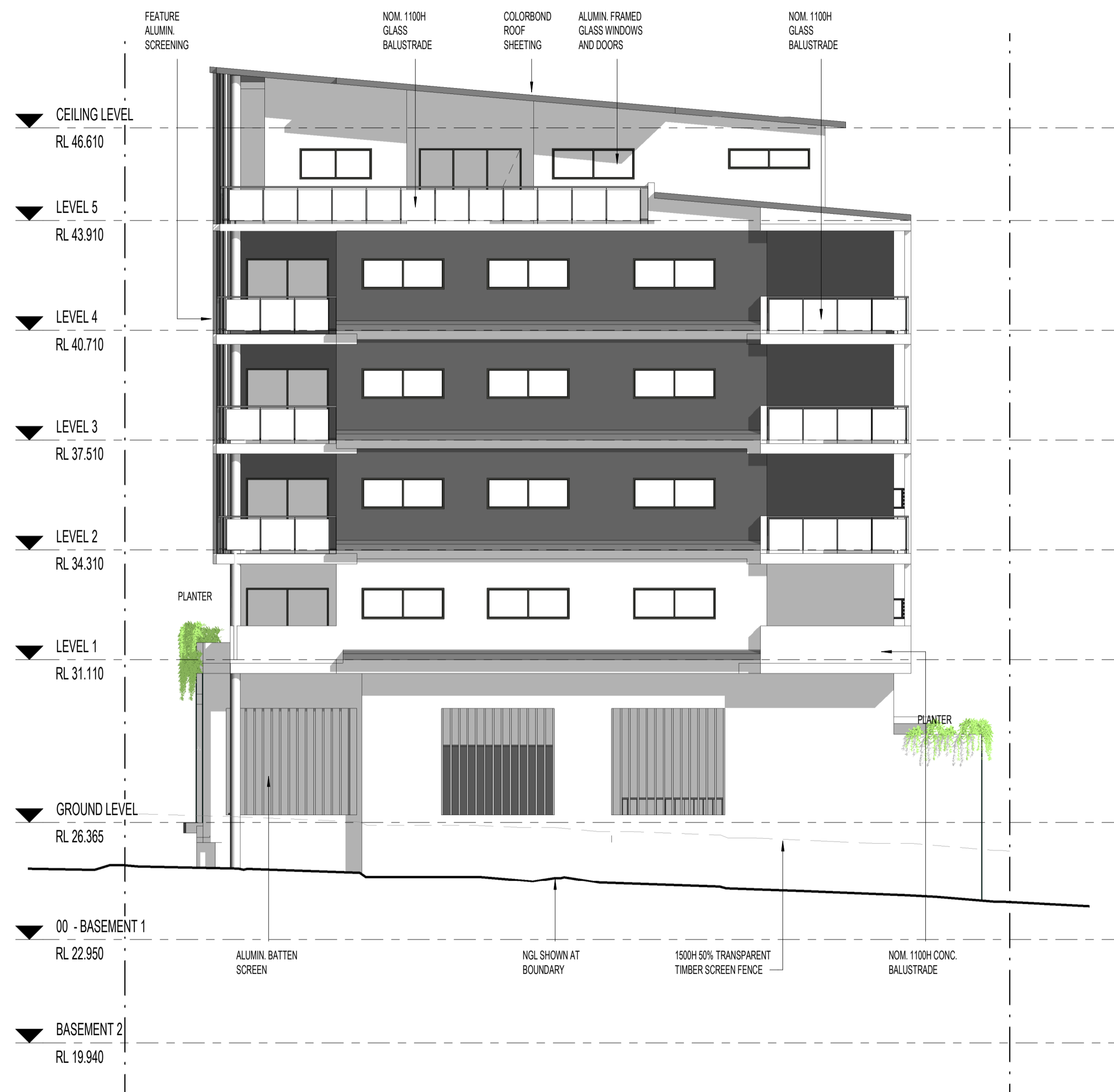
○ NORTH - ELEVATION 1:100