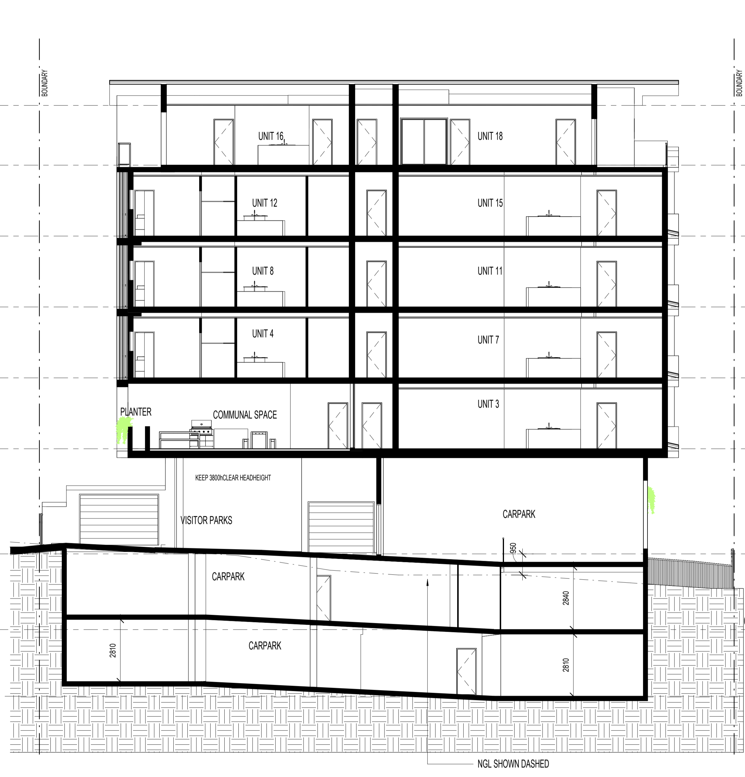
SECTION A-A 1:100