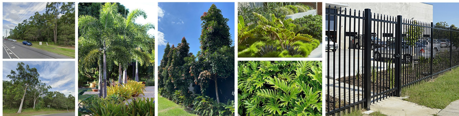
EXISTING STREET VIEWS