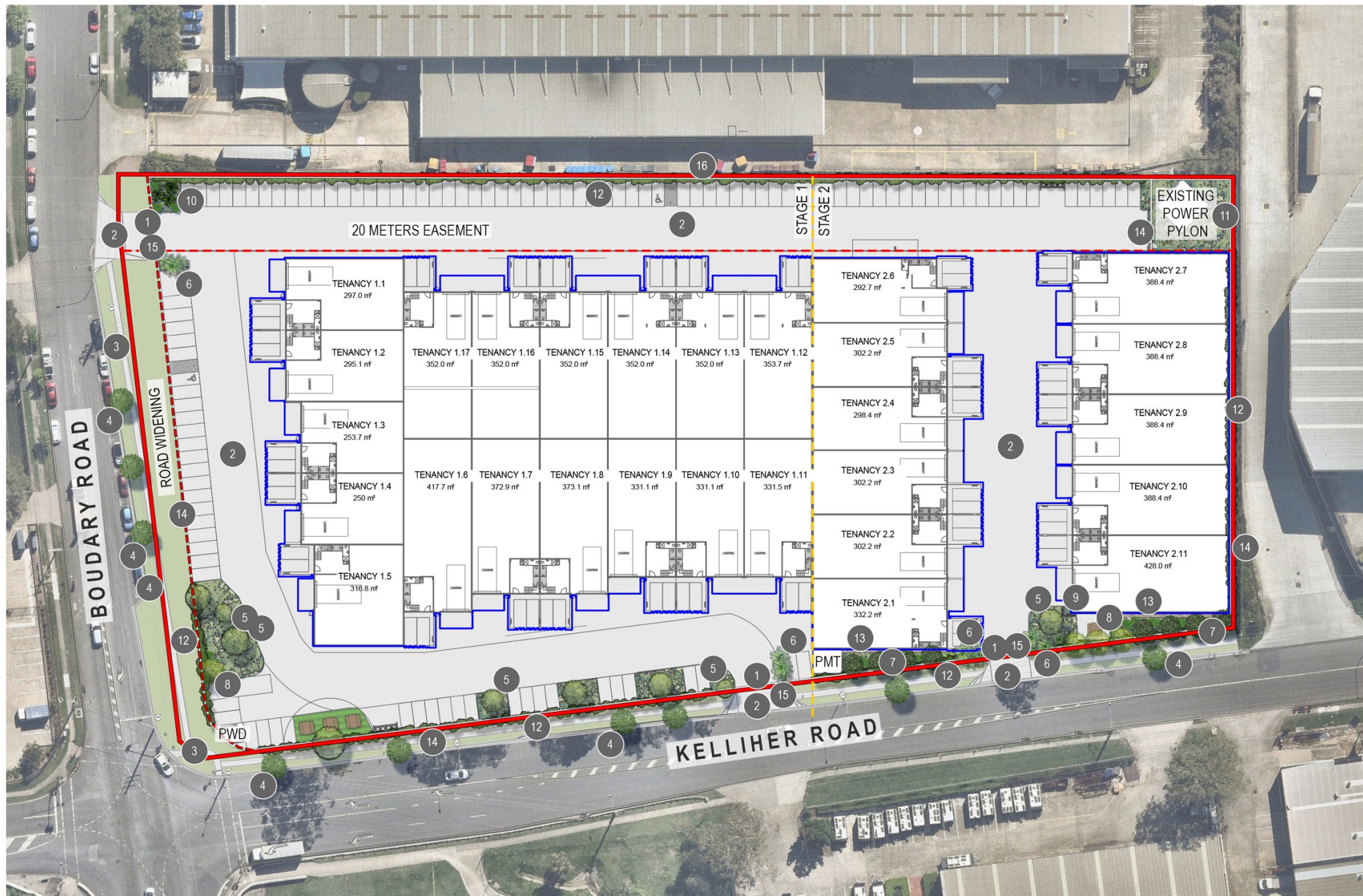
PLAN SCALE 1:500