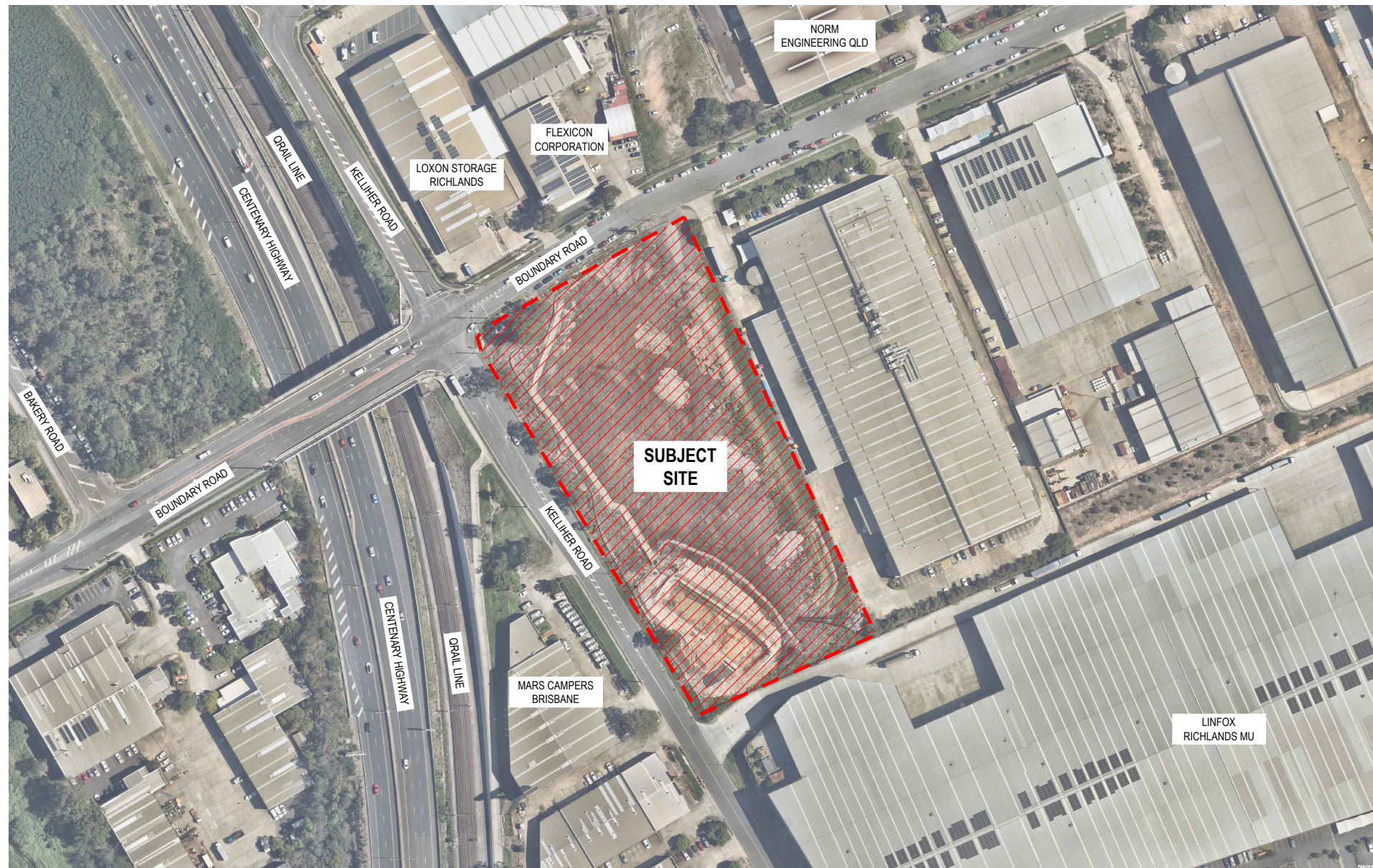
SITE LOCATION NTS