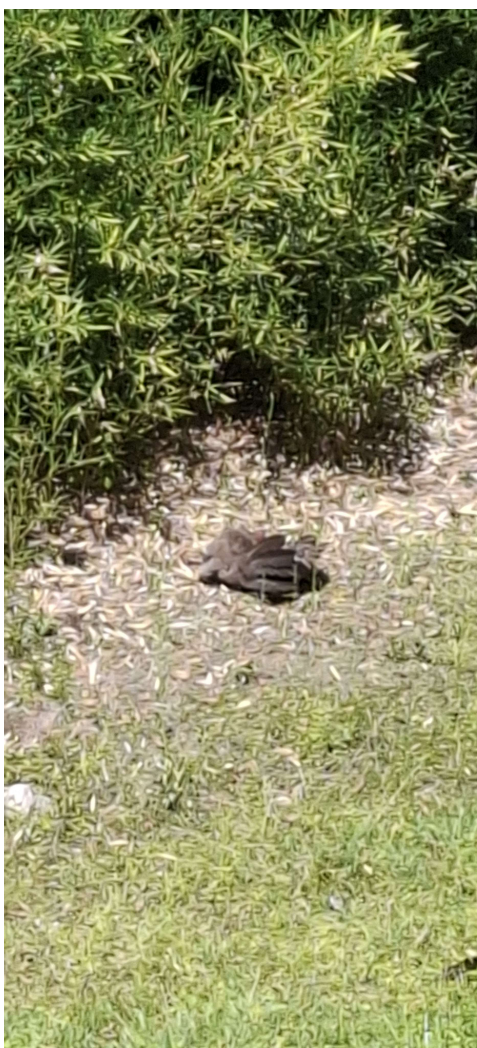
Figure 7: Additional illustrative photograph of a bird observed in the vicinity, included as supporting material regarding local fauna and the existing environment.