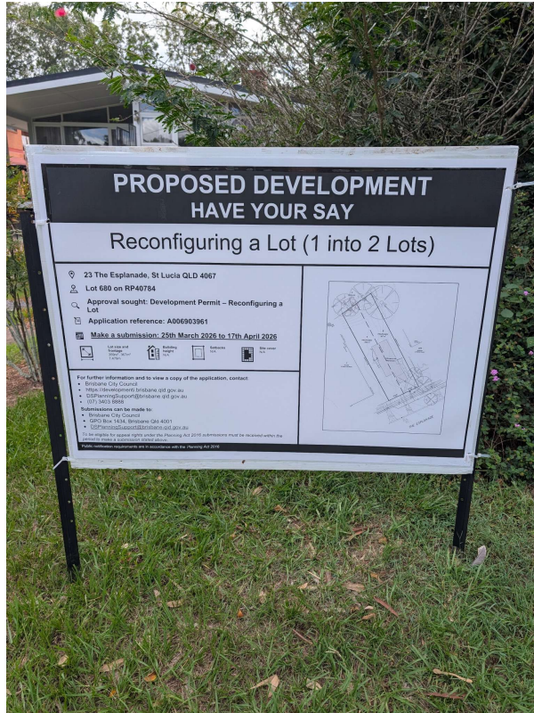
Figure 1: Public notice sign for the proposed reconfiguring of a lot at 23 The Esplanade, St Lucia.