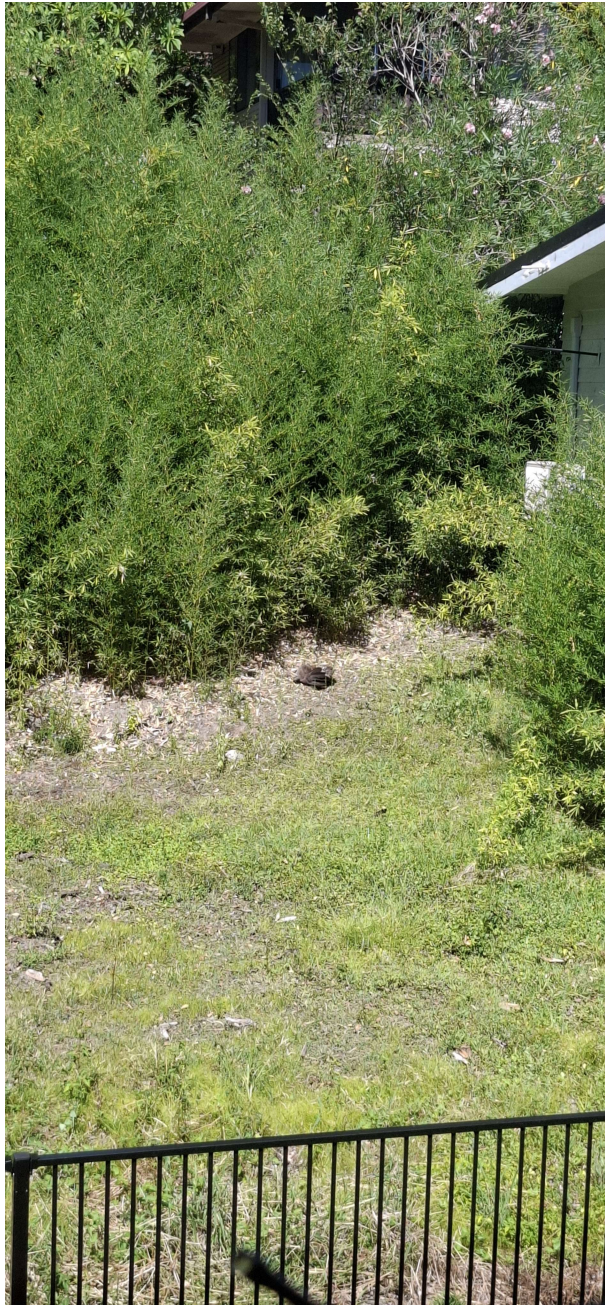
Figure 6: Illustrative photograph of a bird observed in the vicinity, included as supporting material regarding the vegetated environment and local fauna.