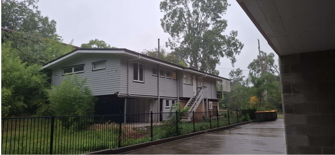
Figure 5: Existing vegetated setting and openness at or near 23 The Esplanade, included as supporting material regarding character and environmental quality.

The surrounding vegetation and open setting also appear to be used by local fauna. Figures 6 and 7 show a bird observed in the area. I include these figures only as illustrative supporting material to show that wildlife uses the site and surrounding environment. I do not assert, on the basis of these photographs alone, that the species is protected or that a specific biodiversity overlay applies. Nevertheless, the images support the broader point that the site contributes to a vegetated local environment that is used by fauna and that this should not be dismissed lightly when assessing the impact of intensified development.