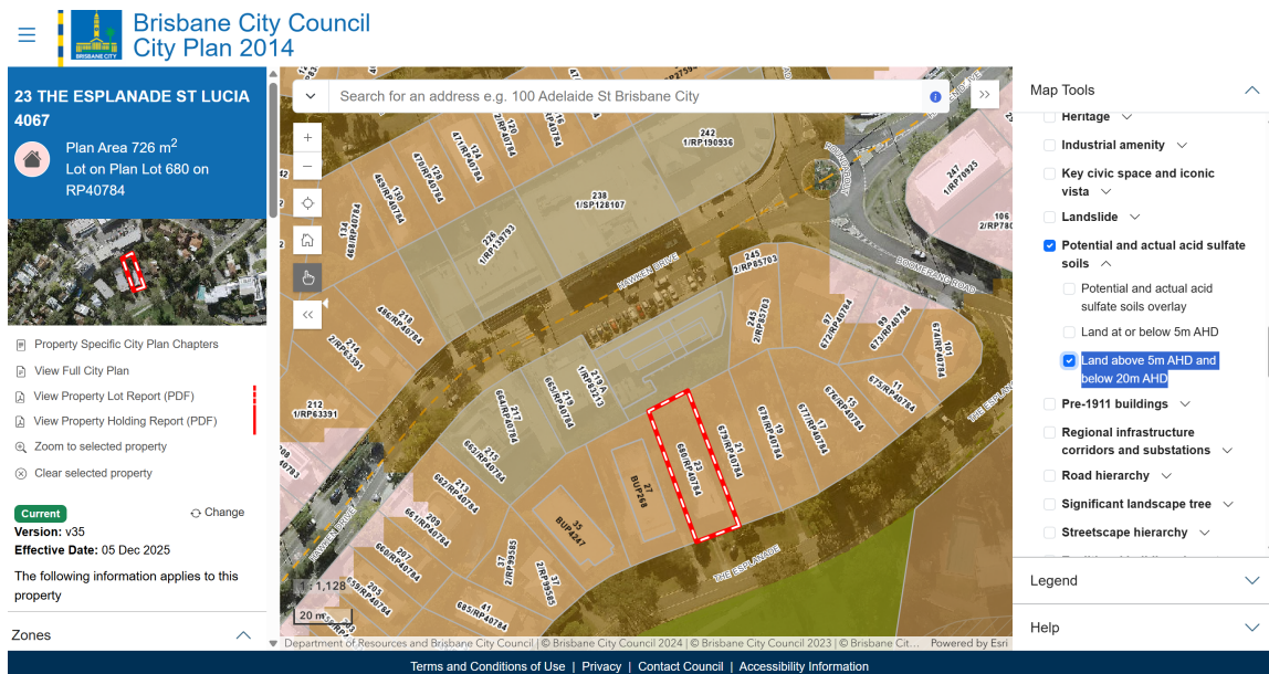
Figure 4: City Plan mapping screenshot showing the property and the apparent application of the Potential and actual acid sulfate soils overlay category land above 5m AHD and below 20m AHD. Included as supporting material regarding site constraints and the need for careful technical assessment if future construction is proposed.