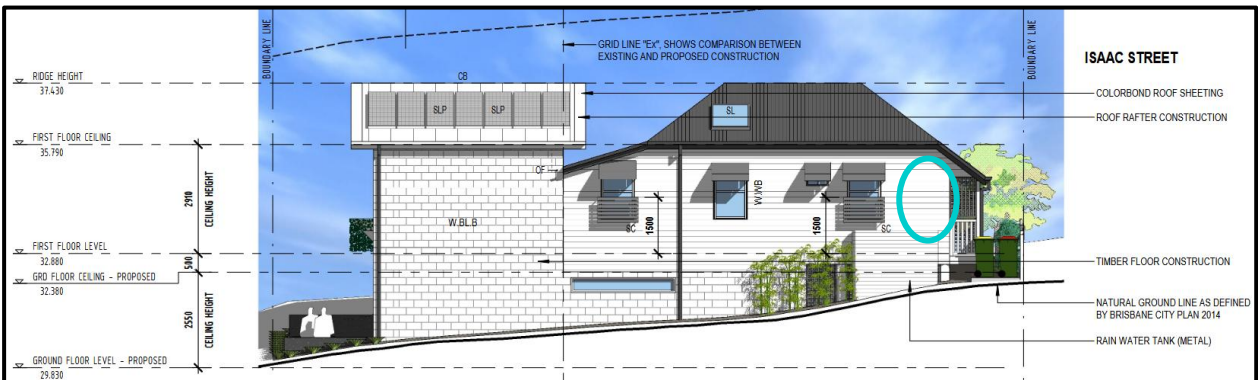
Previously proposed and revised proposed side elevation 2 plan