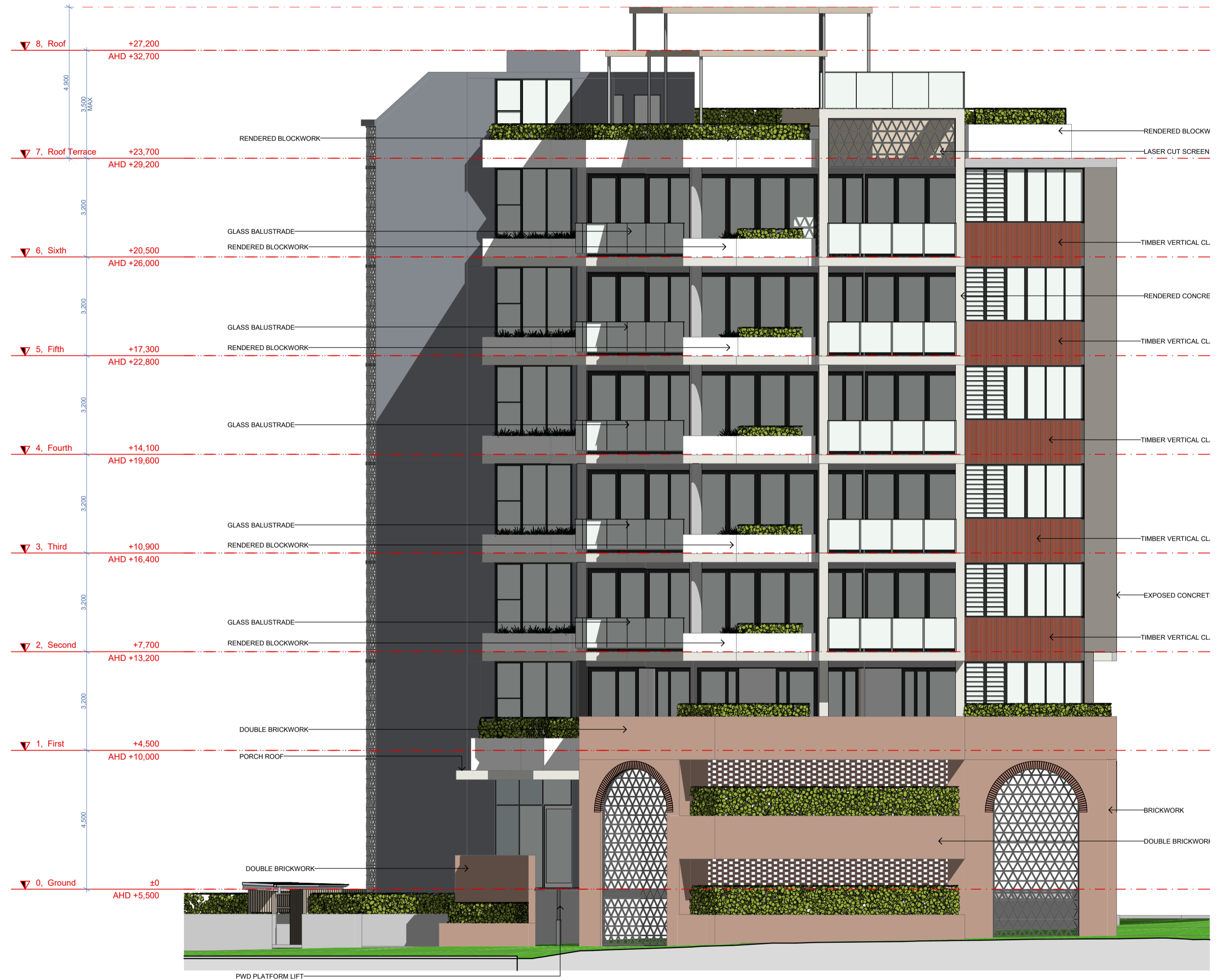
E-01 West Elevation Scale 1:100

BCC DS RECEIVED 20/12/23 APPLICATION REF A006130292