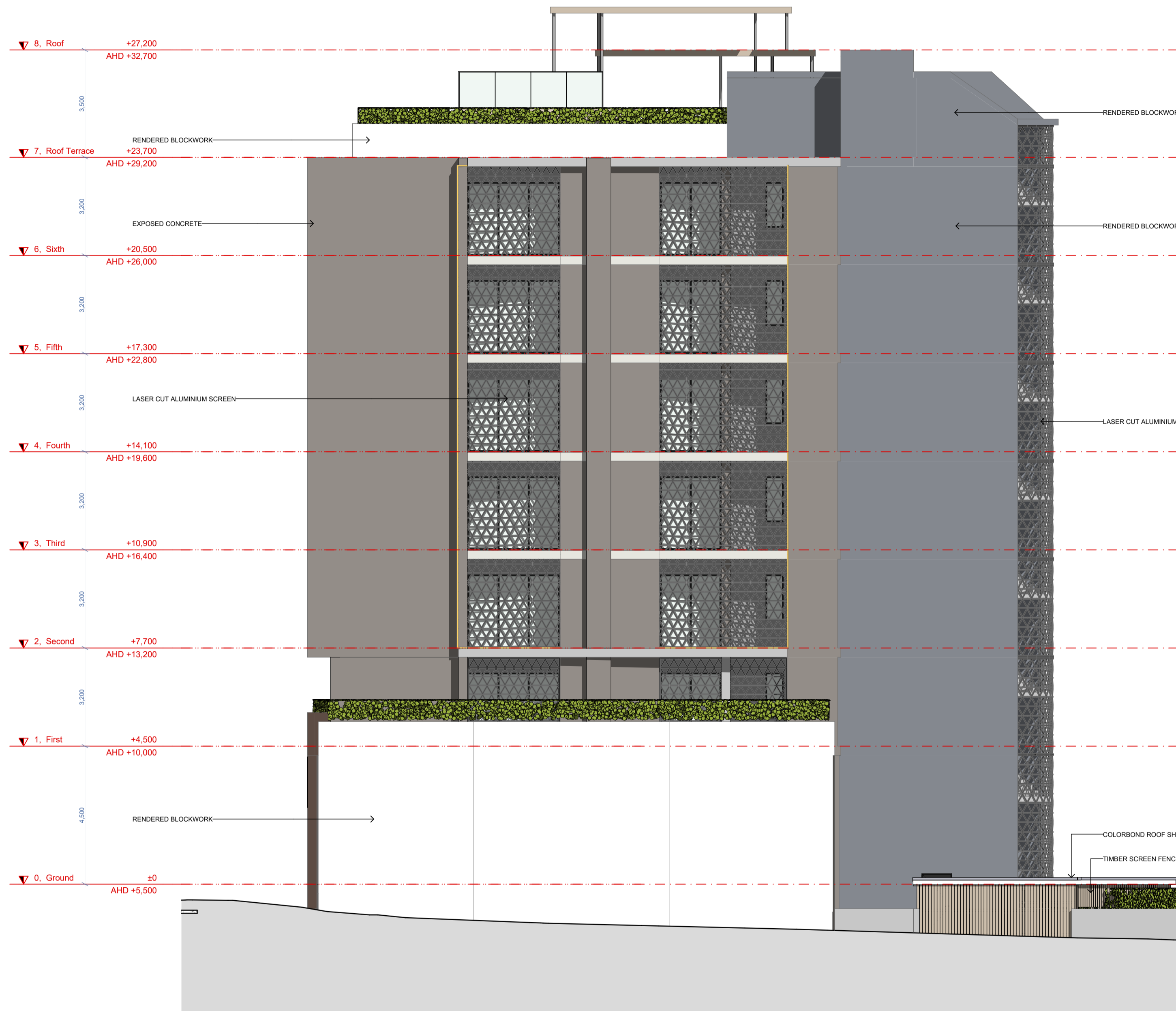
E-02 East Elevation Scale 1:100