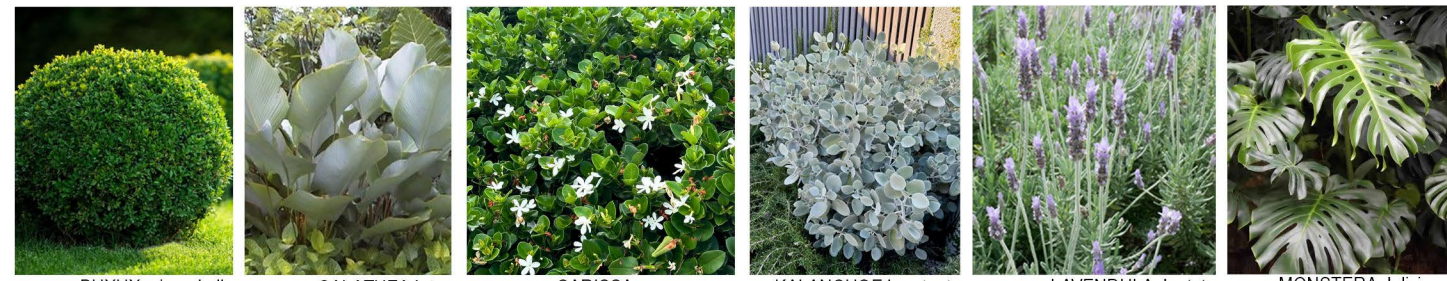
BUXUX microphylla 'Japonica' CALATHEA lutea CARISSA macrocarpa KALANCHOE bracteata 'Silver Spoons' LAVENDULA dentata MONSTERA deliciosa