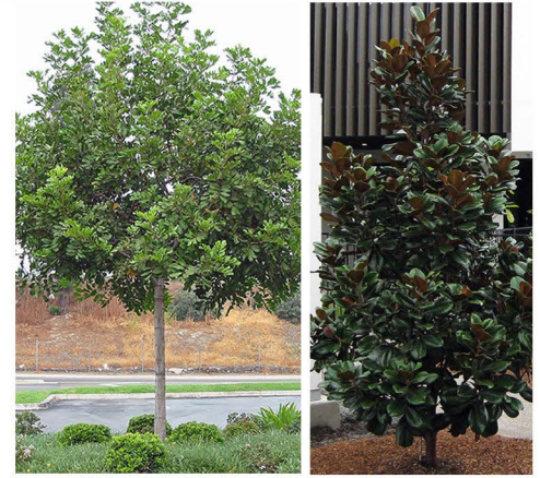
CUPANIOPSIS anacardioides MAGNOLIA grandiflora 'Little Gem'

BCC DS RECEIVED 04/03/2026 APPLICATION REF A006923591