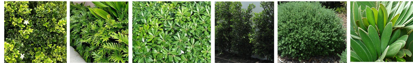
MURRAYA paniculata 'min-a-min' PHILODENDRON 'Xanadu' PITTOSPORUM tobria 'Miss Muffet' SYZYGIUM australe 'Resilience' WESTRINGIA fruticosa 'Zena' ZAMIA furfuracea