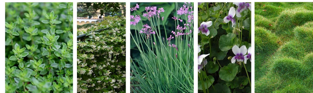
THYMUS vulgaris TRACHELOSPERMUM jasminoides TULBAGHIA violacea VIOLA hederacea ZOYSIA tenuifolia