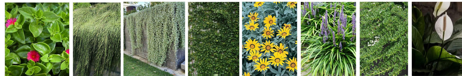
APTENIA cordifolia CASUARINA glauca 'Cousin It' DICHONDRA 'Silver Falls' FICUS pumila GAZANIA tomentosa LIRIOPE muscari 'Evergreen Giant' MYOPORUM parvifolium SPATHIPHYLLUM 'Sensation'