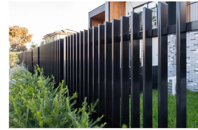
F1 01 INDICATIVE IMAGERY OF 1500mm HIGH ALUMINIUM BATTEN FENCE PAINTED BLACK (50% TRANSPARENCY) - WITH STEP DOWN WHERE REQUIRED. GATES TO MATCH