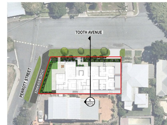
KEY PLAN NTS

BCC DS RECEIVED 04/03/2026 APPLICATION REF A006923591