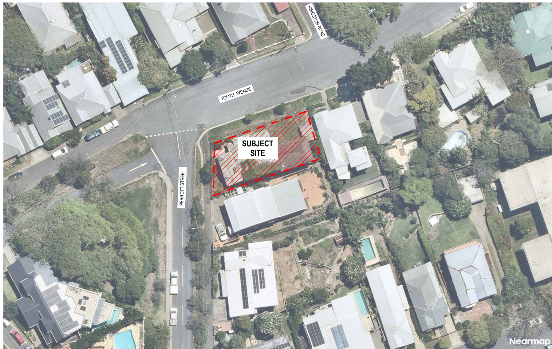
SITE LOCATION NTS