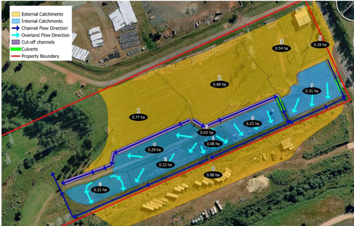
Figure 3: Drainage strategy overview

No modification to the existing channel through the BCC easement along the southern end of site or to the triangular channel provided as part of the initial approved works along the northern end of the site is proposed. All flows are directed into these channels. Modelling undertaken for the SMP suggests that the peak flow depth through this channel will be approximately 350mm upstream of the culvert between catchments 6 and 7 shown in Figure 3. Elsewhere, typical flow depths are in the order of 200mm.