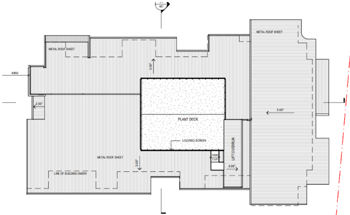
Figure 4: Approved Roof Plan