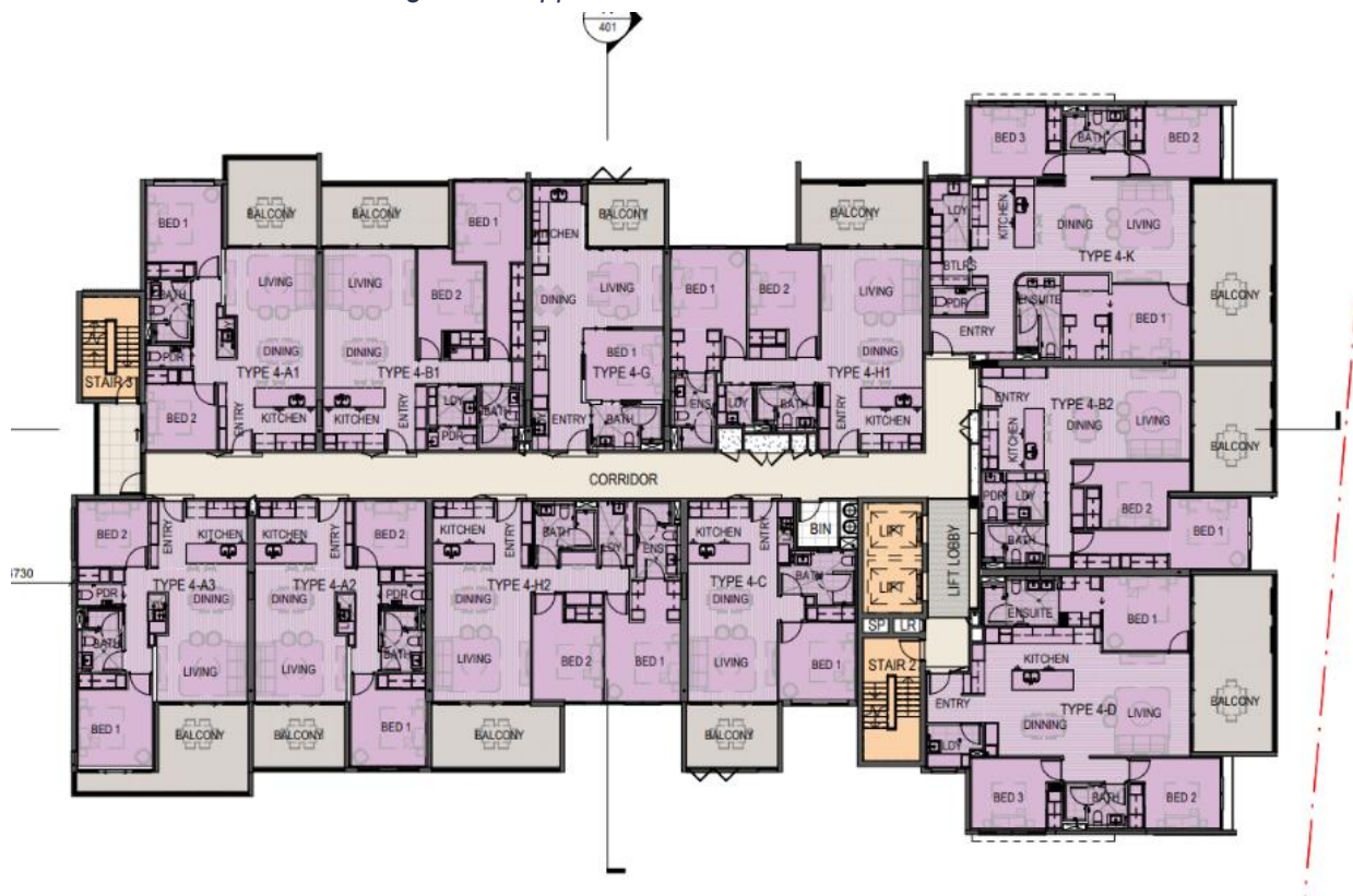
Figure 11: Proposed Floor Plan – Levels 2-7