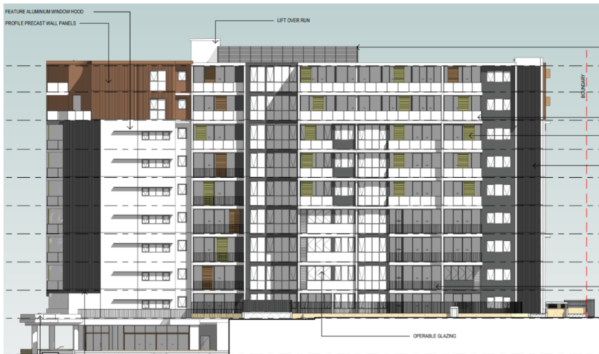
Figure 3: Proposed Elevation – North