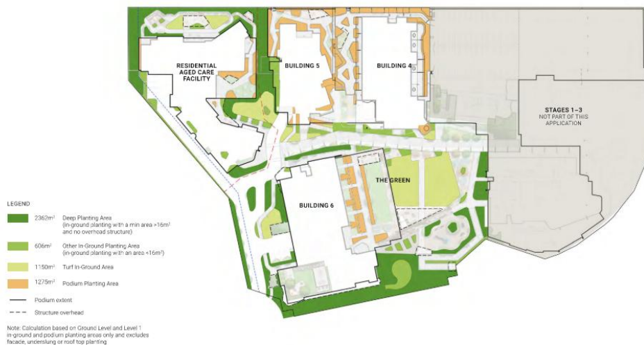
Figure 9: Proposed Deep Planting Schematic Plan