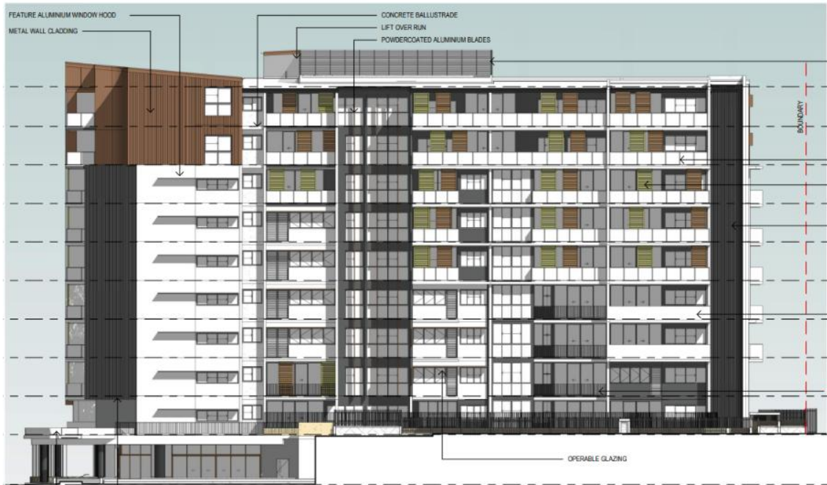
Figure 2: Approved Elevation – North