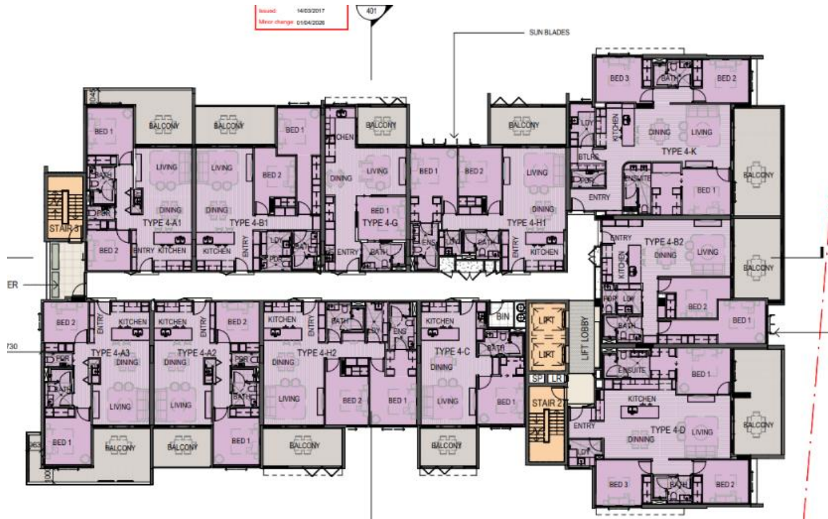
Figure 10: Approved Floor Plan – Levels 2-7