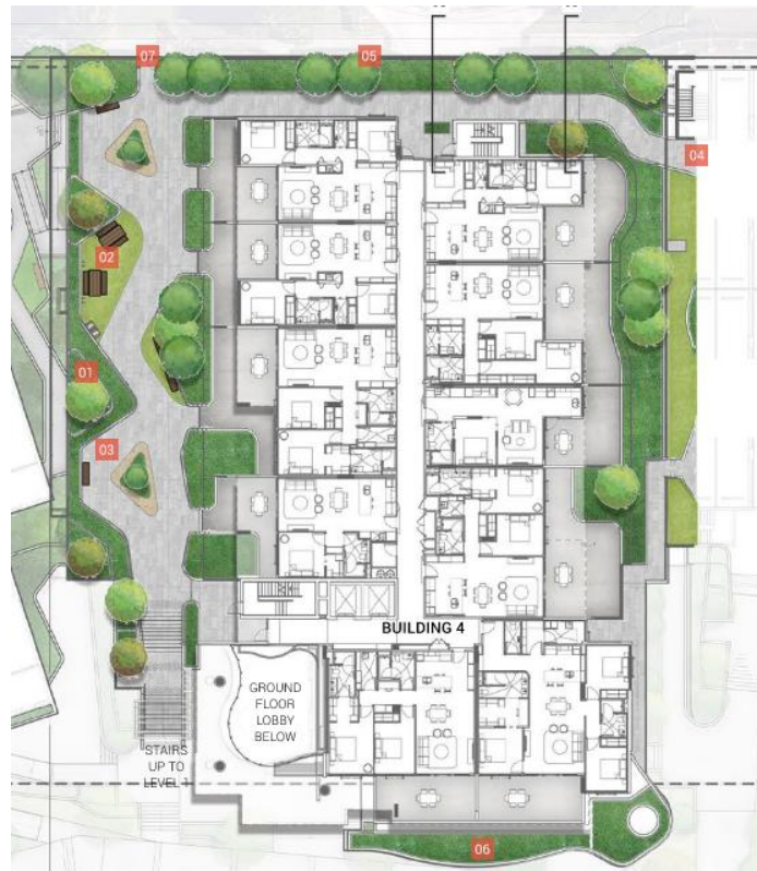
Figure 6: Approved Landscape Concept – Ground Level

superficial changes to pathway design and planter arrangements between Stages 4 and 5, as illustrated in Figures 6 and 7.