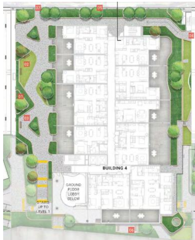
Figure 7: Proposed Landscape Concept – Ground Level