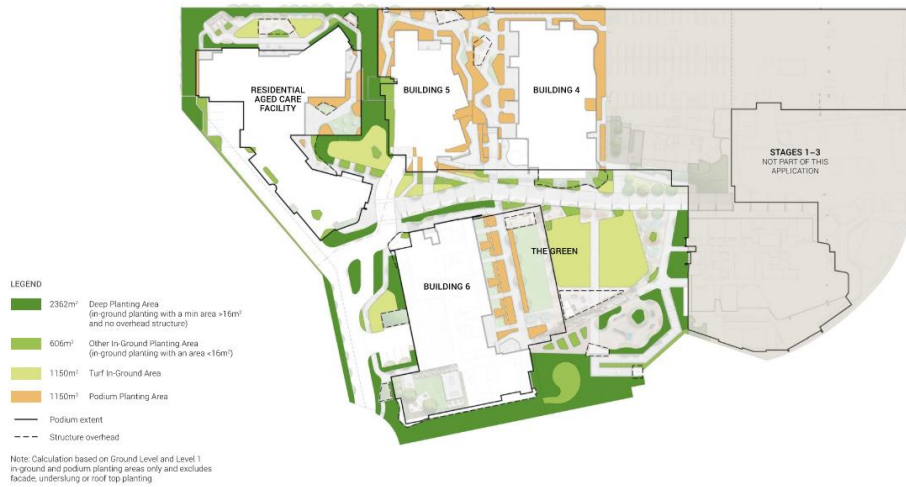
Figure 8: Previously Approved Deep Planting Schematic Plan

Additionally, the proposed plans seek a minor increase to deep planting provided. The change seeks to increase the amount of deep planting provided to 1275m 2 which is an increase of 125m 2 . The proposed change is demonstrated below in Figures 8 and 9.