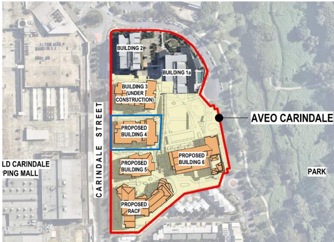
Figure 1: Stage 4/Building 4 Area in blue

This minor change is limited to Stage 4/Building 4 only of the approval A006815790, as illustrated in Figure (i) in blue.