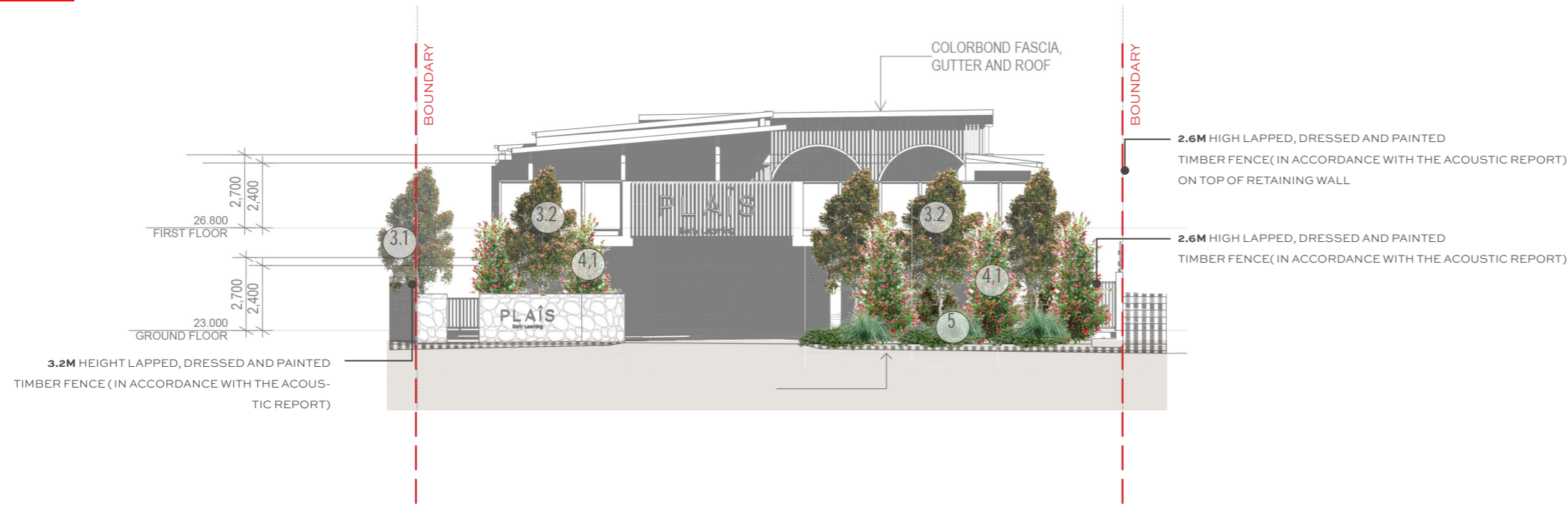
EAST ELEVATION 1-200 A3