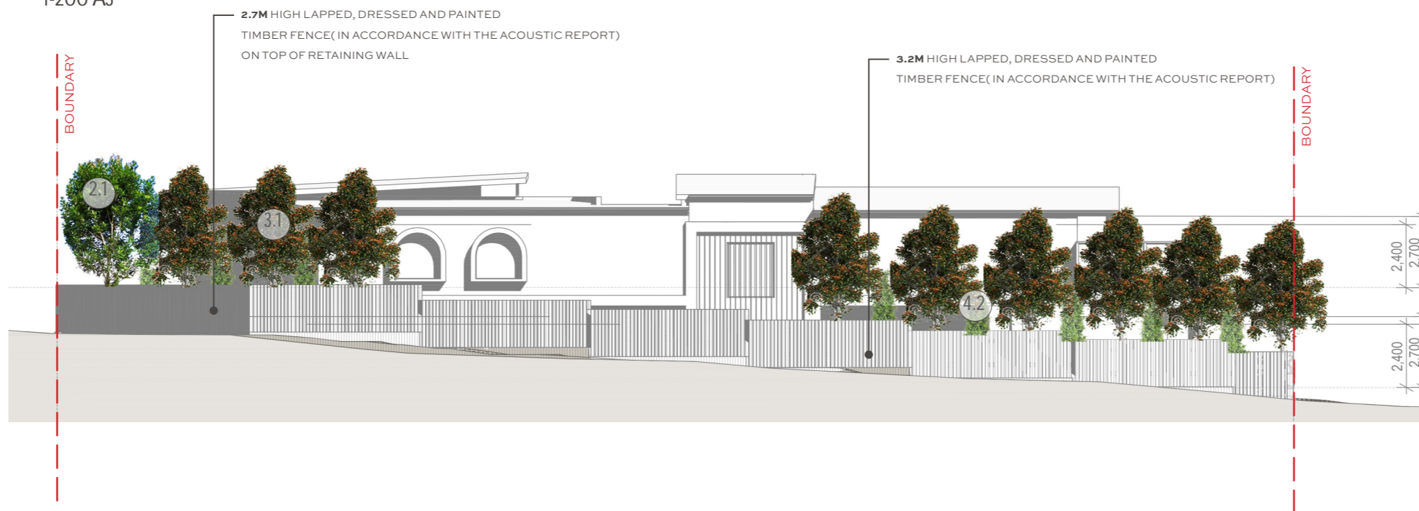
SOUTH ELEVATION 1-200 A3